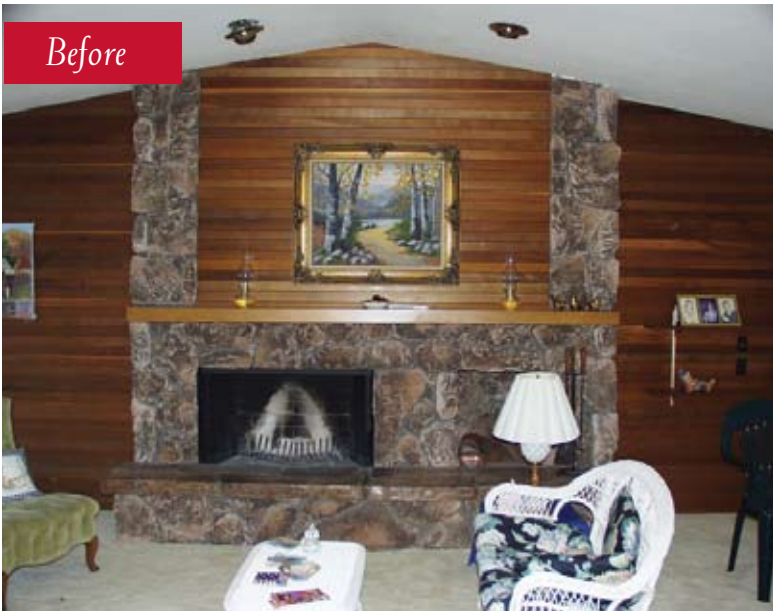
Piazza Construction also specializes in remodels.