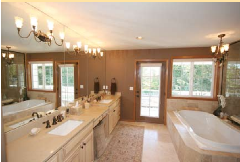
A master bathroom constructed in a second floor addition over a garage.